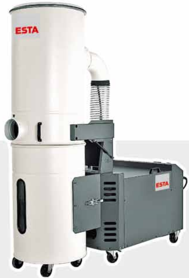
Filtering System for Twin Belt